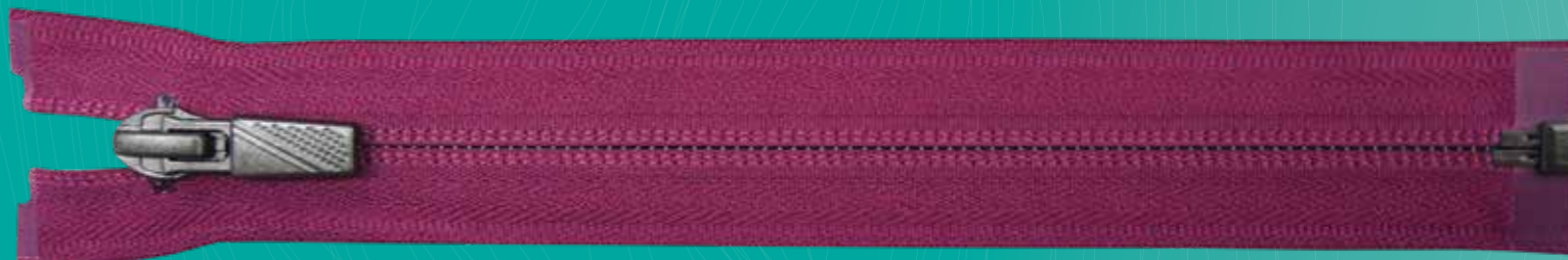
GCFW2202 NATULON Plus™ CIBEOR-56 DA8BTW440 V7 PBR6D GREEN-F OP-V OPM-EC REVERSEP-T