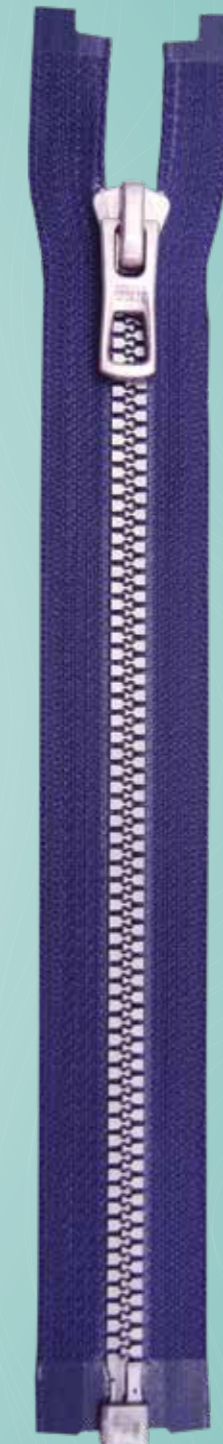
GCFW2208 VISLON® Slim Metallic NATULON® VHQOR-56 NA EB PBR2D EL-VIO4 GREEN-F

YKK's softest, lightest and most packable VISLON® zipper. It is 23% lighter than a VISLON® standard zipper.