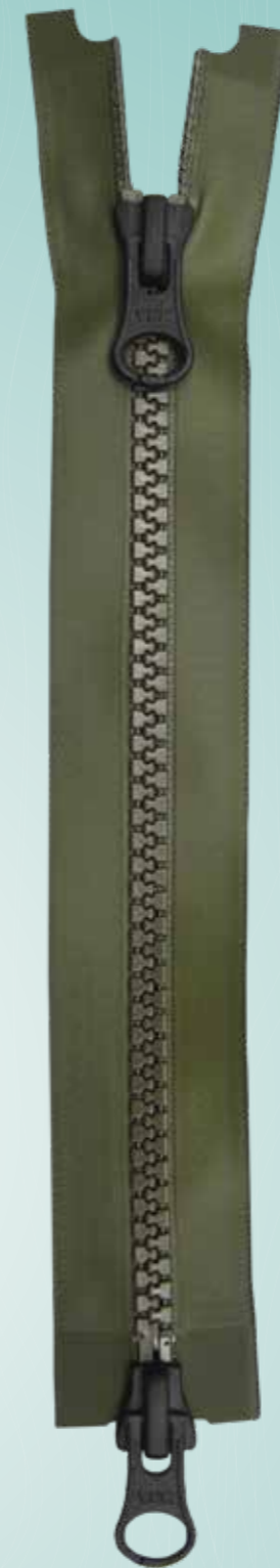
GCFW2207 VISLON® PU Laminated Zipper VSMR-5* DA8LH X6/DA8LH X6 P14A FL3-080