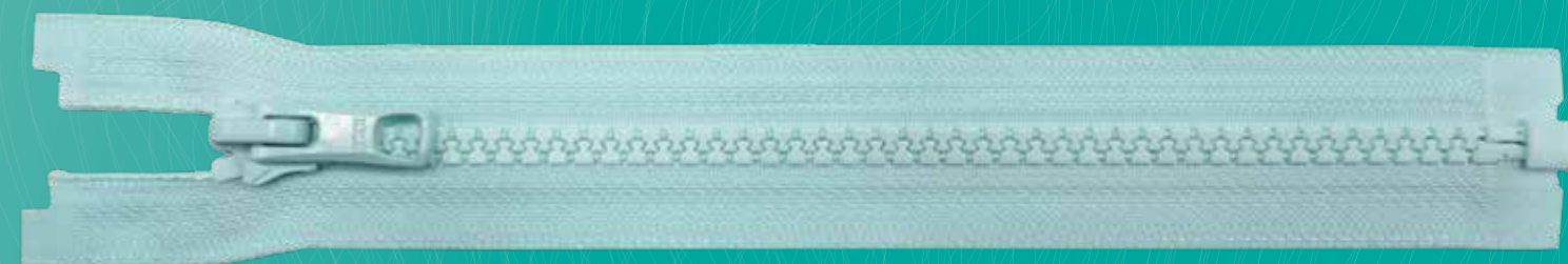
GCFW2212 QuickFree® NATULON® VSOR-56 NAMR2 EW PBR4D GREEN-F OP-2NAM