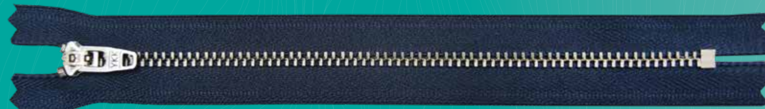
GCFW2203 YZiP® NATULON® Ocean Sourced® YGRTHC-39 GSBN8 NH3 PBR2F GREEN-F