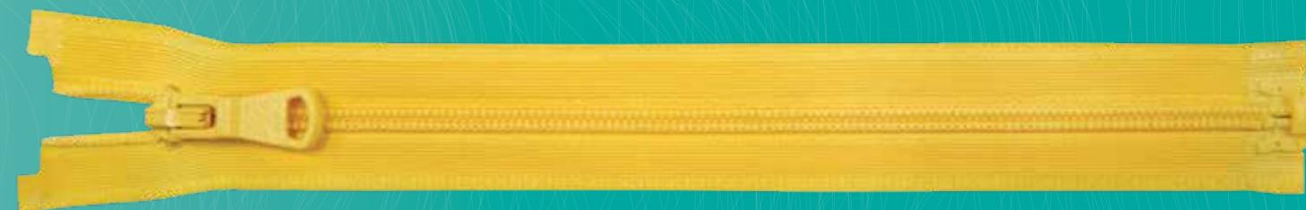
GCFW2211 Waveless Tape CFOR-36 DAOSZ643 E P12G OP-IPOM