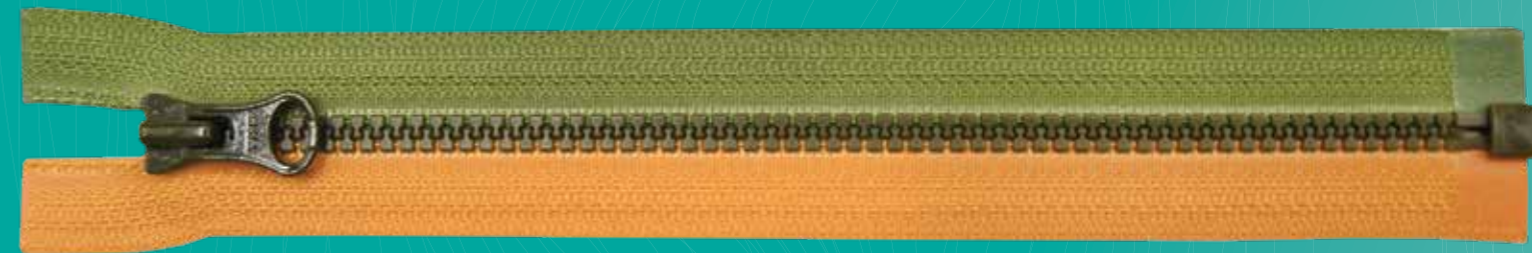
GCFW2201 VISLON® NATULON® VSOR-36 DALH E PBR2D COMBI GREEN-F